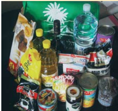
What we put inside