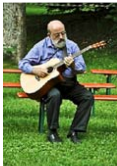
A quiet moment at a worship conference in Germany