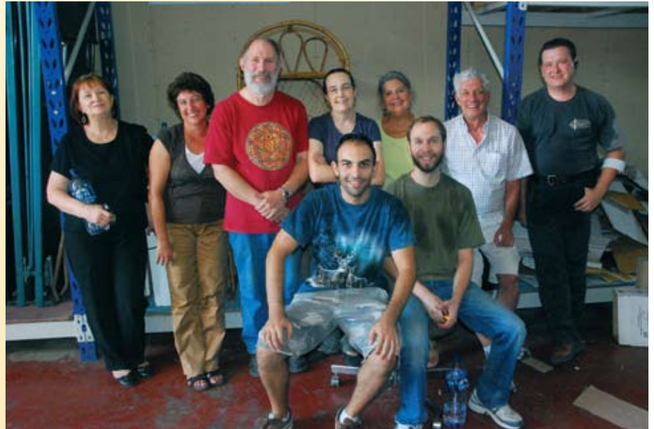
The faithful packaging crew

Judging by the smiles, jokes and singing that went on that afternoon in the Tents of Mercy warehouse, I would have to conclude that we were cashing in on Yeshua's radical promise. "Give and it will be given to you,