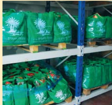
Rosh Hashanah Baskets ready to go